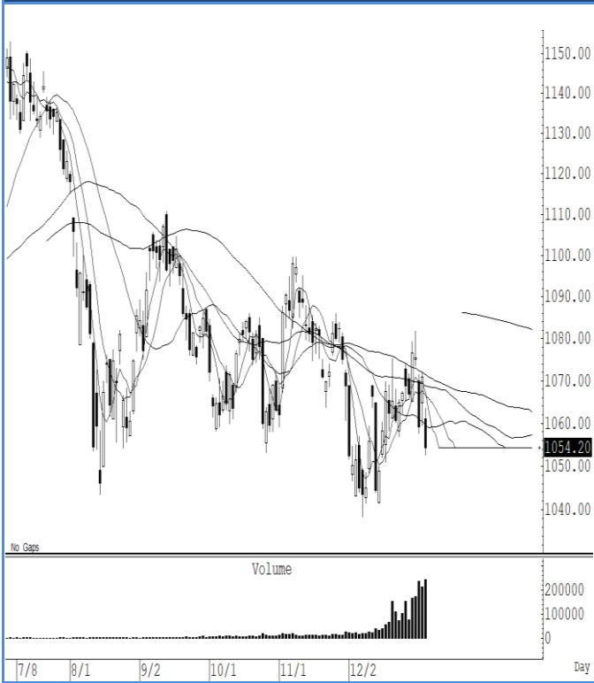
S50H20 (Close 1,054.20 Chg -16.70)