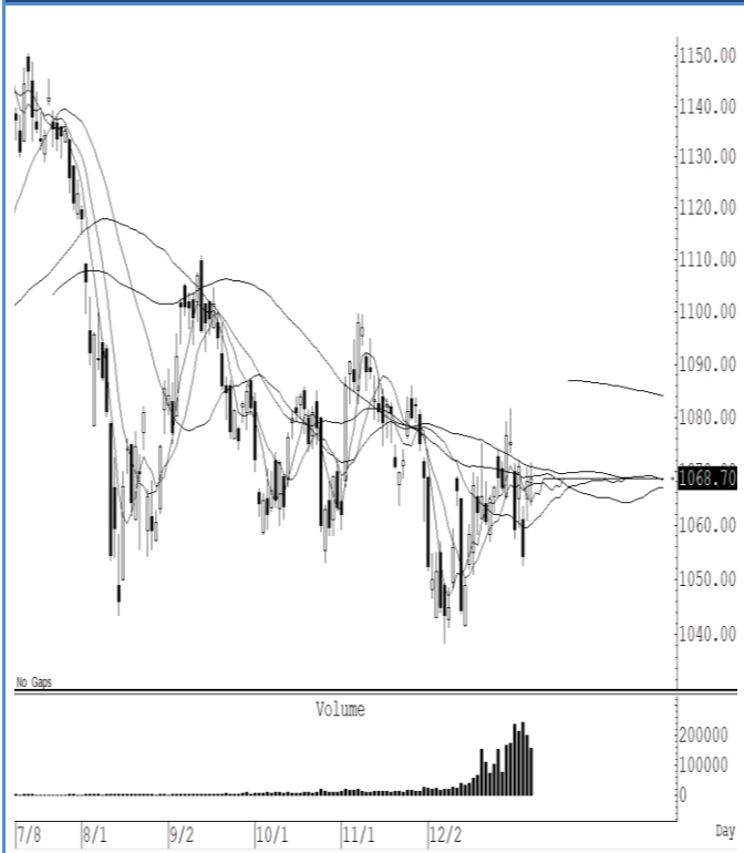
S50H20 (Close 1,068.70 Chg 0.70)