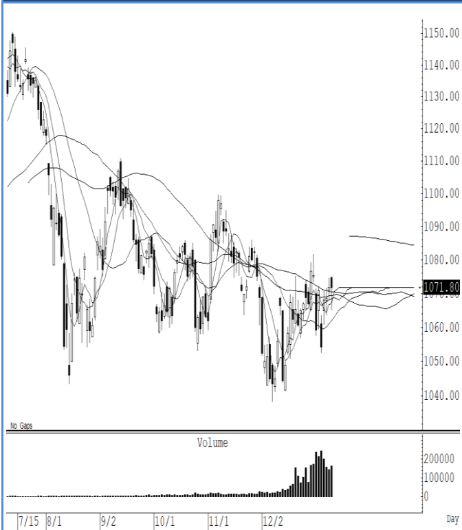
S50H20 (Close 1,071.80 Chg 0.00)