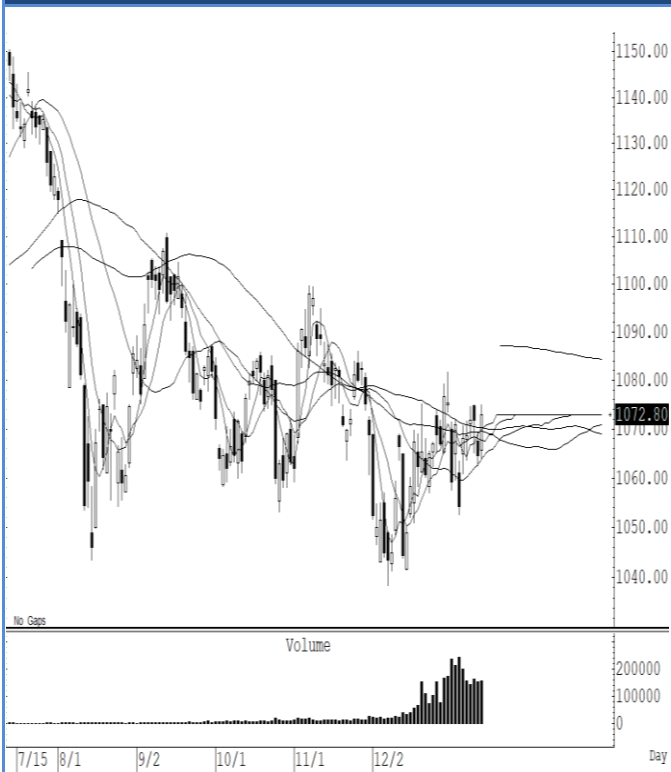
S50H20 (Close 1,072.80 Chg 8.30)

ฟื้นตัวกลับขึ้นมาดีกว่าคาด สั้น ๆ ไม่ต่ำกว่าแนวรับแถว ๆ 1,073 จุด แนะนำ trading ในกรอบระหว่าง 1,073-1,085 จุด ระวังกำไร