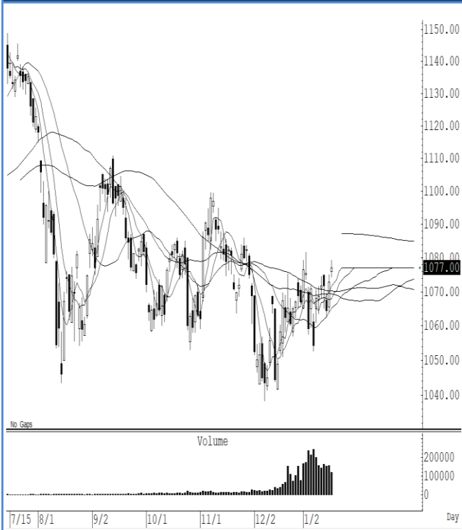
S50H20 (Close 1,077.00 Chg 4.20)