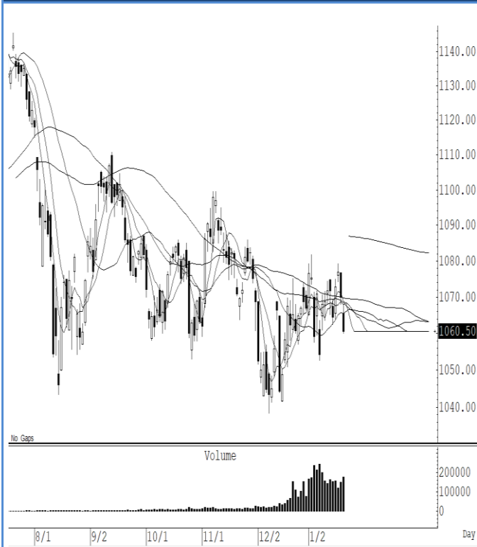
S50H20 (Close 1,060.50 Chg -9.40)