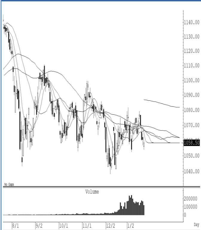
S50H20 (Close 1,058.50 Chg -2.00)