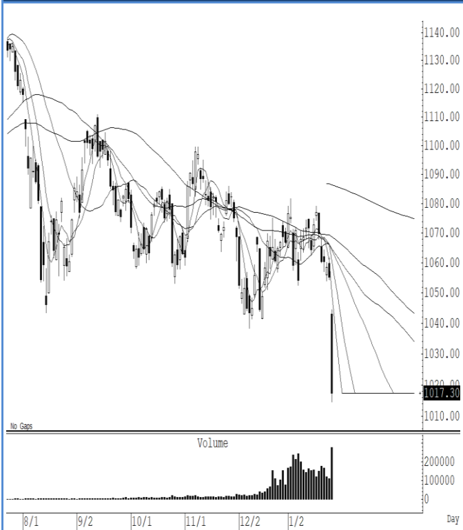
S50H20 (Close 1,017.30 Chg -38.00)

ปรับตัวลงแรงกว่าคาดมาก สั้น ๆ ตีกลับไม่ข้ามแถว ๆ 1,030 จุด แนะนำ trading ในกรอบระหว่าง 1,030-997 จุด ระวังกำไร