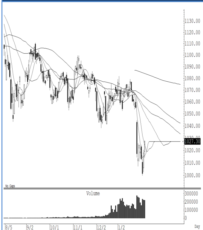
S50H20 (Close 1,027.30 Chg 9.40)

ปรับขึ้นดีกว่าคาดเล็กน้อย สั้น ๆ ไม่ต่ำกว่าแนวรับแถว ๆ 1,017 จุด แนะนำ trading ในกรอบระหว่าง 1,017-1,043 จุด ระวังกำไร